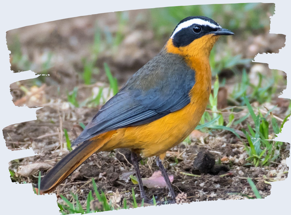
White-Browed Robin-Chat.

The White-Browed Robin-Chat is a shy and very noticeable bird found in the gardens. They are brightly colored and distinctive (different in a special way), both because of their lovely orange underparts, a black crown with white eyebrows. This makes it easy to spot them when they are hiding in darker places -It almost glows. Its wings and back are grey-brown and it has black eyes, and light brown central feathers and its tail is long and brown. White-browed Robin Chat's beautiful song makes it so noticeable and it is one of the prettiest garden birds.