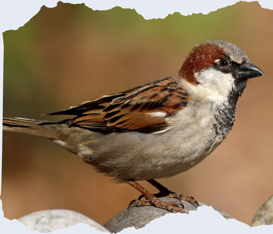
House Sparrow.

These are brown-colored with black streaks on their back. The male and female house sparrows are different in color; the male is dark brown with a black bib, grey chest and white cheeks and the female is light brown on most parts of its body with no black bib, crown or white cheeks. They are found in cities and farms and also in isolated houses surrounded by forests.